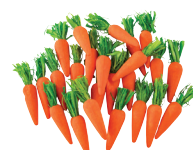
Mini Carrots SH1994