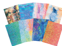
Impressionist Pattern Paper TH932