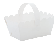
Easter Hunting Basket CS7213